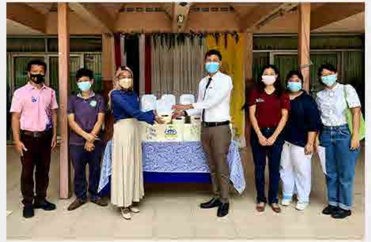
Community partners at our Ford Resource and Engagement Center in Bangkok prepare educational kits for children in grades 4-6 and deliver to schools in nearby neighborhoods.

Our purpose as a company is to help build a better world, where every person is free to move and pursue their dreams. It is a core value, ingrained in Ford’s DNA since our company’s founding more than a century ago, and it is what drives us every day at Ford Fund as we work to make people’s lives better and ensure no one gets left behind.