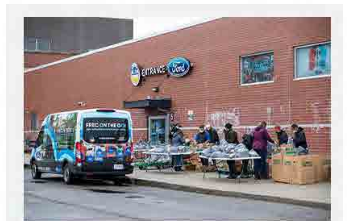
Food distribution at the Ford Resource and Engagement Center on the East side of Detroit.

Through numerous literacy, mentoring, workforce development and educational initiatives, we helped remove barriers to economic opportunities and create pathways for growth for hundreds of thousands of under-resourced individuals of all ages.