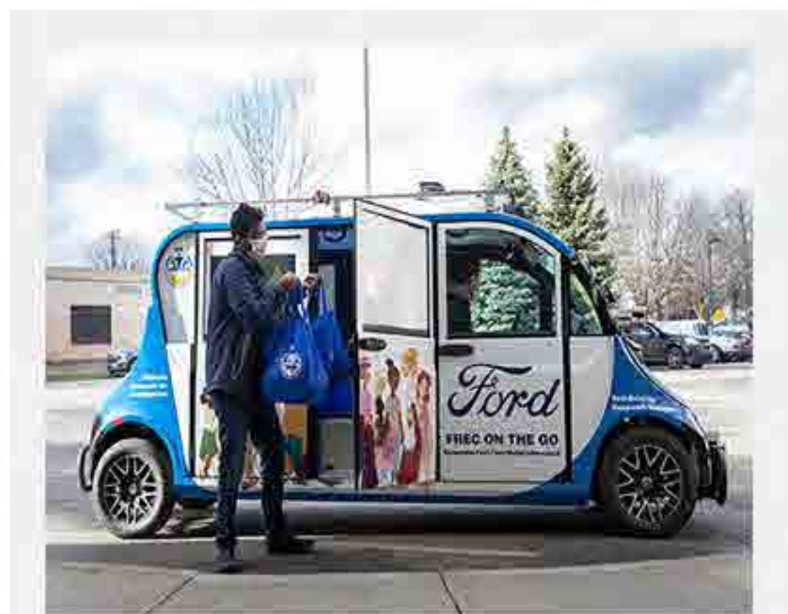
Ford's autonomous vehicle shuttle delivers fresh food to the doorsteps of mobility-challenged senior citizens in Southwest Detroit. During a six-month pilot, the low-speed shuttle is running along a fixed route in the Michigan Central impact area, where Ford is researching mobility innovation.

Leveraging our mobility expertise, we launched two exciting new initiatives in the Michigan Central impact area in Southwest Detroit to connect people with the things they need most. In partnership with Ford's future technology autonomous vehicle team, we are delivering 10,000 pounds of fresh food to mobility-challenged seniors using specialized autonomous vehicle technology.